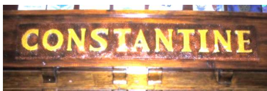
(A) Sharpened and blurred image

From table 1, we can see that the proposed method gets excellent performance in terms of recall rate. Compared to other methods, the performance improvement in terms of recall rate is 3% higher for ICDAR 2015 dataset. Fig 4 shows the successful detection of text from the proposed method on the ICDAR 2015 dataset and Fig 5 shows unsuccessful detection of text from the proposed method on the same dataset.