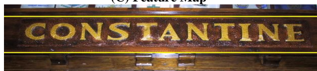
(D) Text Detected Image