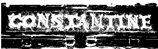
(B) Convolved Image