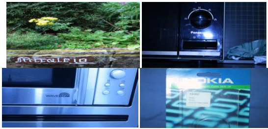
Fig 5: Unsuccessful samples of the proposed method on ICDAR 2015 database