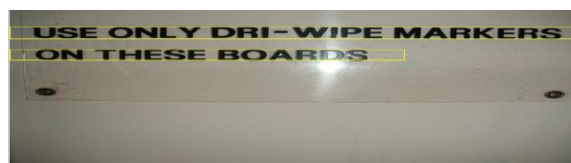
(d) Text Detected Image