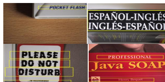
Fig 4: Successful samples of the proposed method on ICDAR 2015 database

Experiments are carried out on ICDAR 2015 dataset and the results show that the proposed approach outperforms for various kinds of images. Here are some of the future directions that can be made for the proposed approach: (1) for sharpening and blurring, Gaussian blur and low pass filters are used, instead other filters can also be used. (2) Some of the non-text regions are also detected in few of the images, which can be avoided.